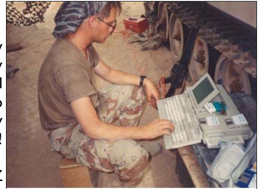
The owner during the first gulf war

We have a couple retail computer stores in Phoenix, AZ and buy tons of off-lease computers and laptops. As a result,