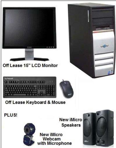
Off Lease 15" LCD Monitor

we can afford to put together a full computer package for only $150 - a price that is significantly below wholesale. This system includes: